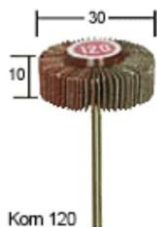
NO 28 985