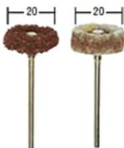
NO 28 282

Elastic and adapt to the contours of the work piece being processed. For machining inaccessible spots. Shaft \varnothing 3.0mm.