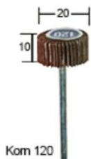
NO 28 984